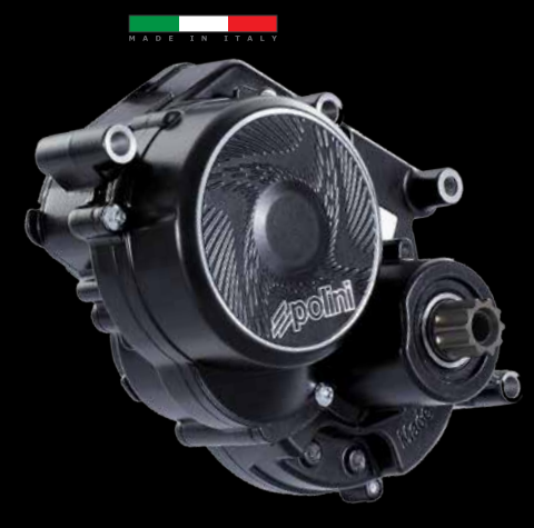
IMPULSO ROAD IMPULSO ALLROAD